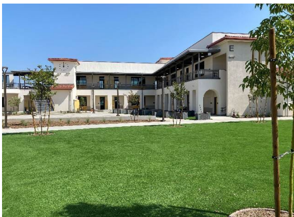
Building E two-story classroom

The campus is approximately 9.8 acres located on Lincoln Street. The school will serve approximately 750 TK-6 students in the Casa Blanca neighborhood. The new school will include ancillary support buildings, outdoor shared learning spaces, TK-K classrooms with play area, 1st-3rd grade classrooms with play area, 4th-6th classrooms with play area, staff and visitor parking lot, and a bus drop-off. Measure O expenditures through June 30, 2025: $63,910,220.76.