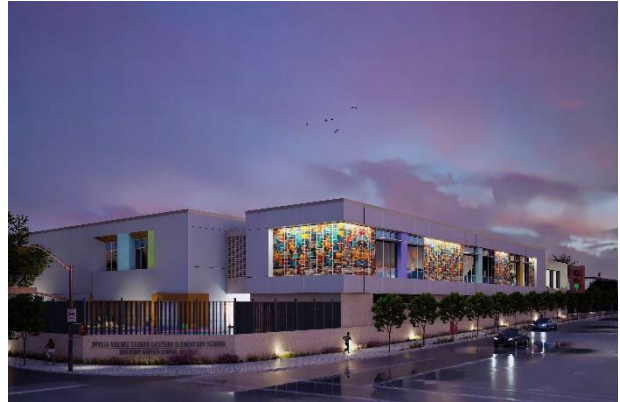
Corner of 14th St. & Howard Ave.

Anticipated Completion Date: August 2028