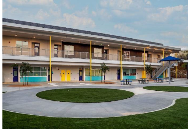
New two-story classroom