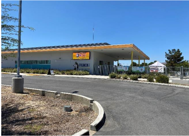
New marquee sign

Fremont Elementary School is one of the oldest schools in the District, built in 1917. Under Measure O, the project includes a new two-story building with six (6) general classrooms and six (6) kindergarten classrooms with interior restrooms, new play equipment and surfacing, landscape, elevator, covered walkway, exterior restrooms and storage. Site work includes removal of four portables and demolition of existing Building J, new kindergarten play yard, hard court play area, turf, accessibility upgrades, new visitor parking lot with fifteen (15) regular and two (2) accessible parking stalls, grading, striping and slurry of existing parking lot, and utility upgrades. A new digital marquee was added to the project scope in 2025.