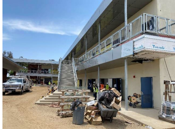
Two-story science building exterior

Anticipated Completion Date: October 2025