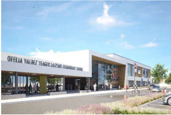
Front of school from 13th St.

The District has completed the acquisition of properties comprising the campus and the site is currently undergoing review by the Department of Toxic Substances Control (DTSC). The school will serve approximately 900 students from TK through 6th grade. Measure O expenditures through June 30, 2025: $8,154,981.26.