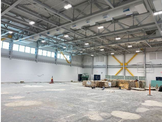
New gym interior

John W. North High School was built in 1965. This Project is currently in construction of phases 2 and 3. The project includes a new 2-story science building and a new 900-seat competition gymnasium, campus entry and site improvements, new seating and shade structure in the quad, and the removal of eight portables. ESSER funding project scope includes HVAC and lighting upgrades to campus buildings that is being performed in several phases to minimize disruption to the site. Under Measure O, the HVAC lighting upgrade project will also include new paint, flooring, fire alarm upgrades, and restroom upgrades in Building 300.1. Total Measure O expenditures through June 30, 2025: $27,989,189.07.