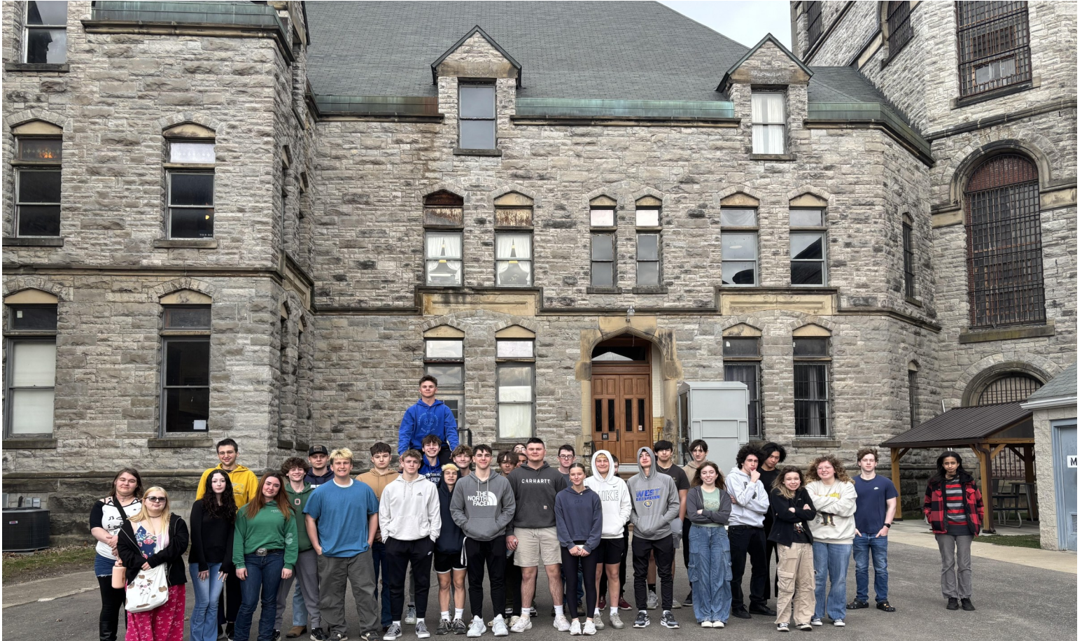
Mansfield Reformatory Field Trip