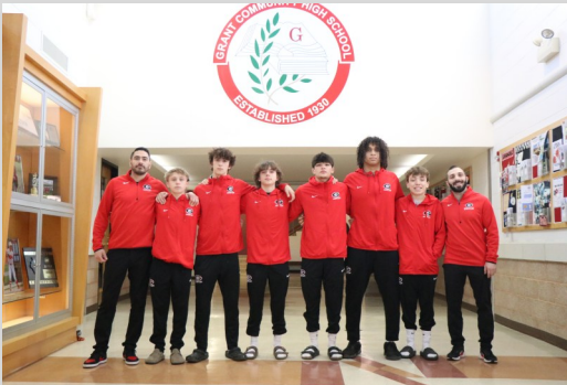
Boys Wrestling State Send-Off