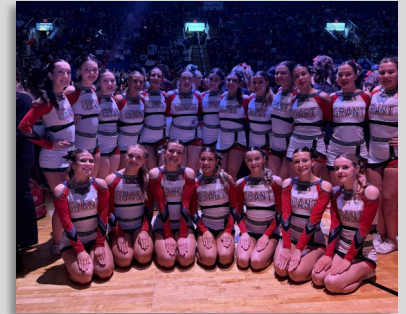
Varsity Cheer at State

Our Grant Cheerleaders wrapped up their season at the IHSA State Finals, finishing 20th in the state. While the team didn't advance to Day Two, qualifying for State with the highest sectional score in program history is a major accomplishment and a reflection of the growth they showed all season long. Congratulations to our cheerleaders and coaches on a strong year and a great postseason run. Proud to have you represent Grant!