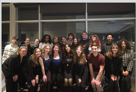
Talking Bulldogs at State