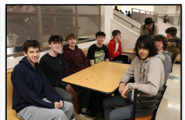
Sophomore Class at the Be On Time Challenge Donut Social