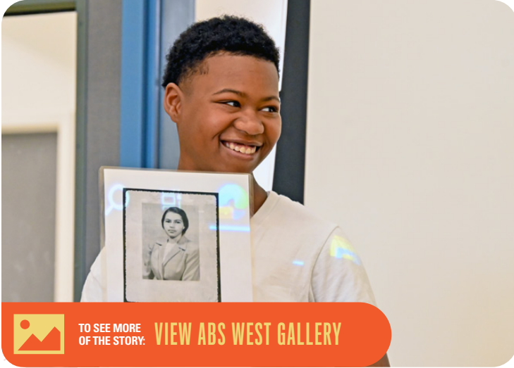
TO SEE MORE OF THE STORY: VIEW ABS WEST GALLERY