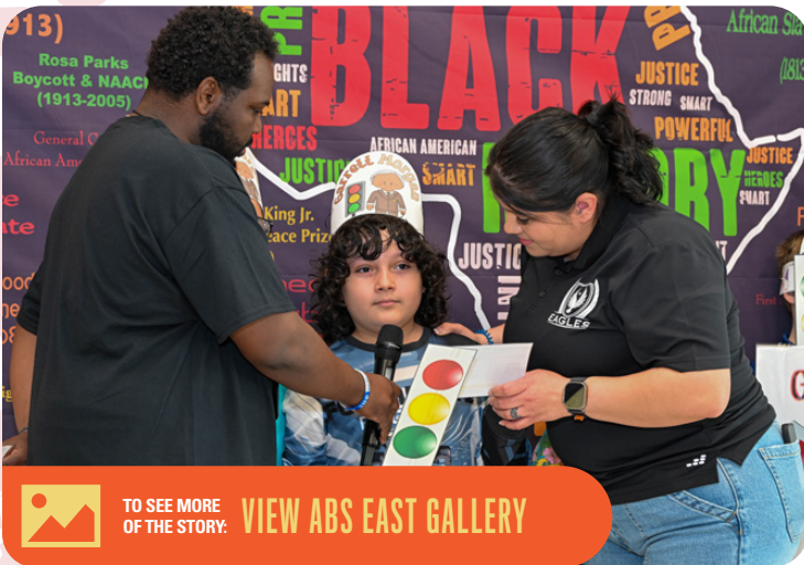
TO SEE MORE OF THE STORY: VIEW ABS EAST GALLERY