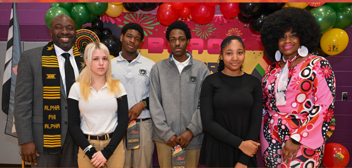
Highpoint School students and administration pose for a photo following their Black History Month program.

WE SERVE STUDENTS and learners who routinely fall within the blind spots in education. Populations where resources may be limited or requirements to invest in these students may be long and arduous. Harris County Department of Education staff is resourceful – if there’s a way to better the educational experience for learners across the county and region, #TeamHCDE will find it and use it. This week, ABS West unveiled its newest venture – a Production Workshop for its Adult Transition Program featuring two shirt heat press machines, one hat heat press machine and 3D printer. Students in the program are already learning living and employment skills, with the goal to help those who can lead independent, fulfilling lives. The program even partners with local businesses to put those job skills to work outside the classroom and campus. A production workshop takes the learning opportunities to the next level. Not only will students be able to expand their workforce training by designing and producing shirts and hats, but the finished products will benefit the program down the road with sales and revenue. I applaud Mr. Hutton’s vision of bringing this working lab to our students and can’t wait to see how it expands in the future.