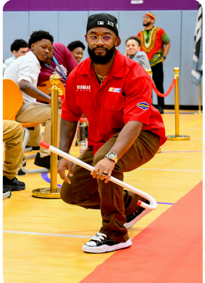
TO SEE MORE OF THE STORY: VIEW HIGHPOINT GALLERY