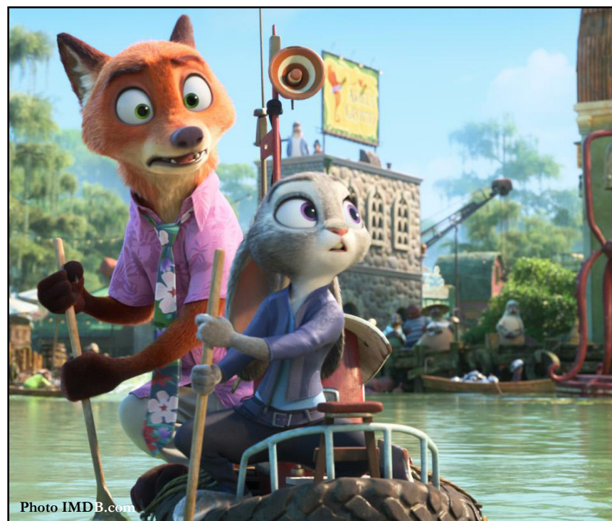
Wilde and Hopps follow De'Snakes trail to the swamplands.

Judy and Nick make a great team and their friendship is the focus of movie 2. They do a great job playing off each other throughout the movie, adding lots of humor in their banter. The cast includes some new characters as well, including Gary De'Snake (Ke Huy Quan), Nibbles Maplestick (Fortune Feimster), Pawbert Lynxley (Andy Samberg), Dr. Fuzzby (Quinta Brunson), and Mayer Winddancer (Patrick Warburton). Some favorite characters from the first film are also back Chief Bogo