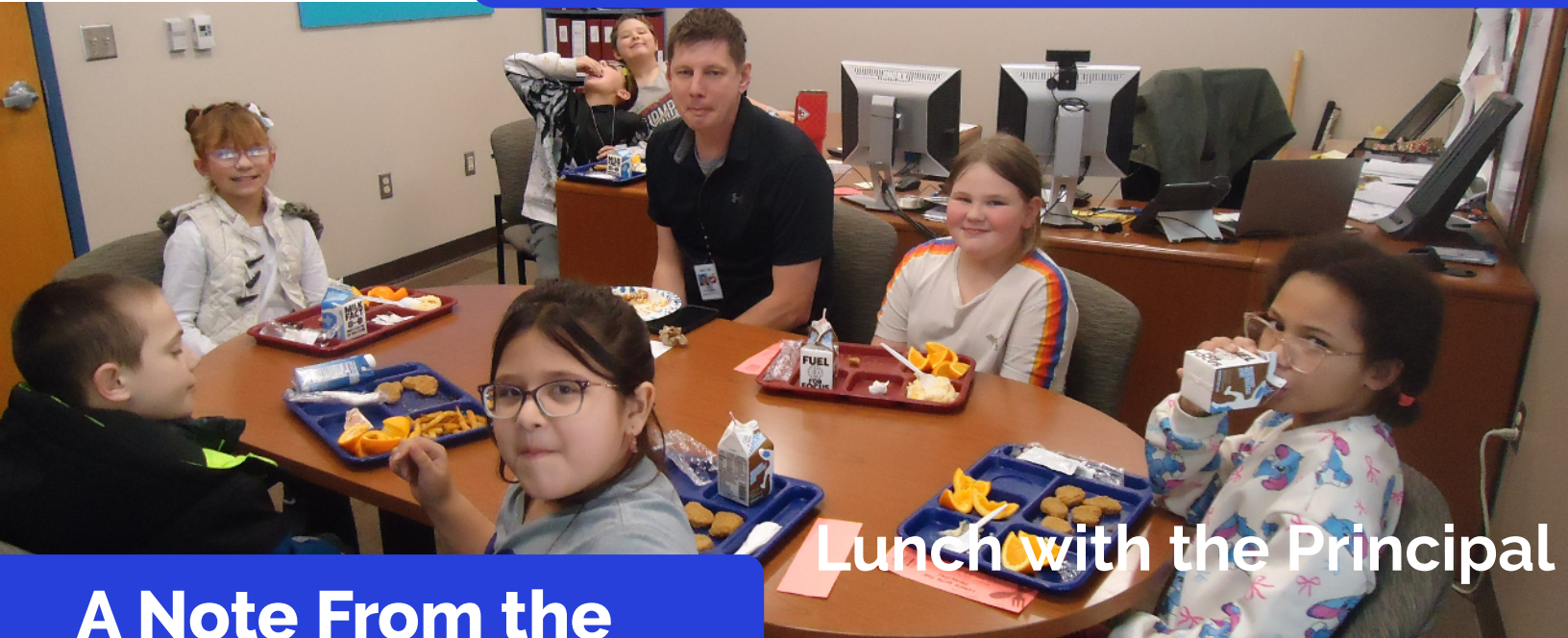
Lunch with the Principal