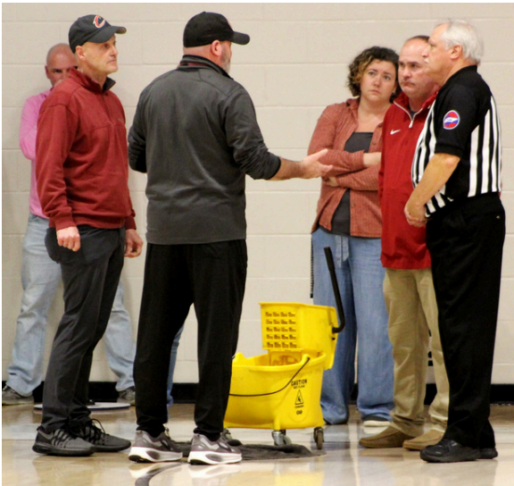
Above: Crockett administrators meet with game officials after detecting a roof leak, causing Saturday night's homecoming boys game to be switched to the auxiliary gymnasium.

Imagine three couples deciding to go out together to a nice restaurant for a Valentine's Day dinner and being seated in a roomy booth for six. But after eating their appetizers, the restaurant manager comes over and says, "Excuse me, folks, but we need to move you over to that small triangular table in the corner. It only seats three, but maybe a few of you are already full and will choose to go home instead."