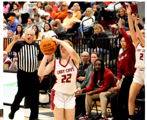
Below: ... which promptly bursts into celebration as Smith's shot zips through the net to extend Crockett's lead.