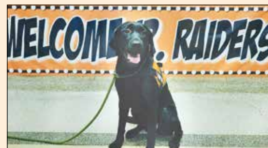
Birdie – Early Childhood Center

We're excited to share that our therapy dogs are making a positive impact on our students!