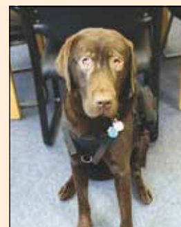
Elmer – Elms