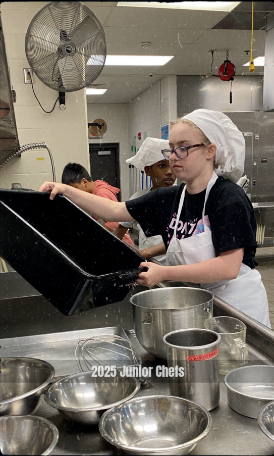
2025 Junior Chefs