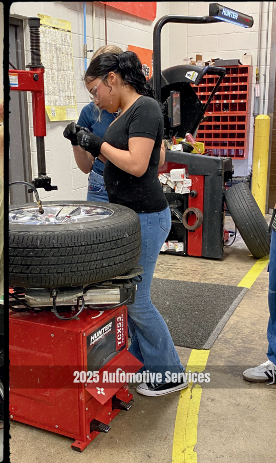
2025 Automotive Services