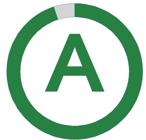
Closing the Gaps