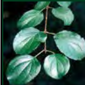
Invasive Species - Common Buckthorn "Rhamnus cathartica"