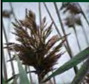
Invasive Species - "Phragmites australis"

Environmental Protection Agency - Green Acres Tip Card