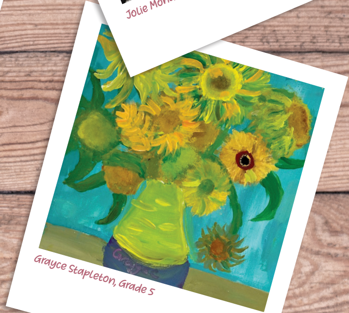
Grayce Stapleton, Grade 5

ACADEMIC EXCELLENCE PERSONAL GROWTH SOCIAL RESPONSIBILITY