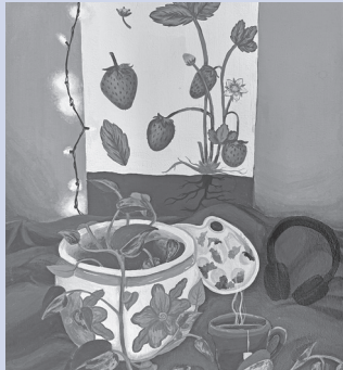
Hazel Shepard, Grade 9