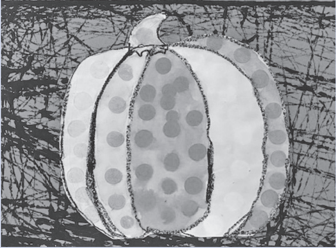
Dominic Paolucci, Grade 2

We continuously recruit substitute teachers, bus drivers, cleaners, and food service staff. Interested applicants should visit the HR Personnel page under the Departments and Services tab on the district website.