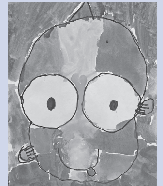
Geneva Goliszek, Kindergarten