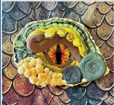
Vera Zilliox, Grade 4