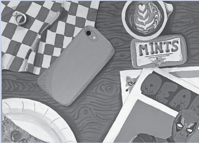
Sophie Myers, Grade 9