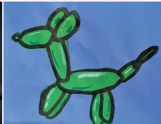
Aiden Daghestani, Grade 3