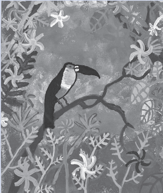
Lucy Ceccato, Grade 5