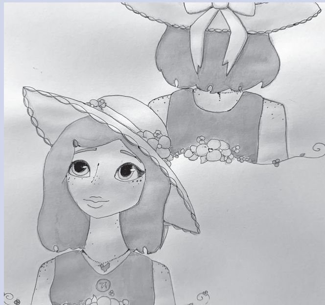
Riley Myers, Grade 10