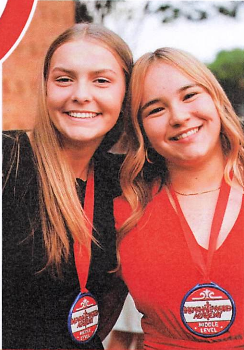
- IWA Class of 2025 Alumna

“I benefited from tuition assistance and I would like to thank our donors for investing in me to be able to continue learning and growing within my faith.”