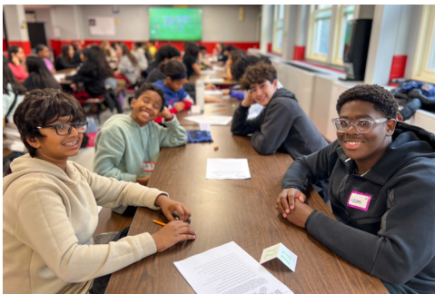
High school and middle school students collaborate.

The Big Brothers Big Sisters Program had its first session in October. BHS mentors and their RWB mentees began with a "get-to-know-you" board game, rolling dice to land on questions that helped participants learn about each other. It set the stage for strong, lasting connections to grow throughout the year.