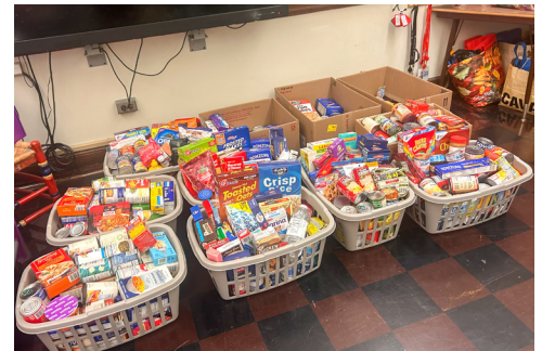
Bins of collected food products.