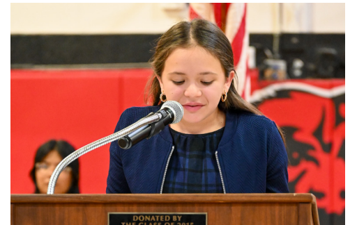
The 4th grade essay contest winner.