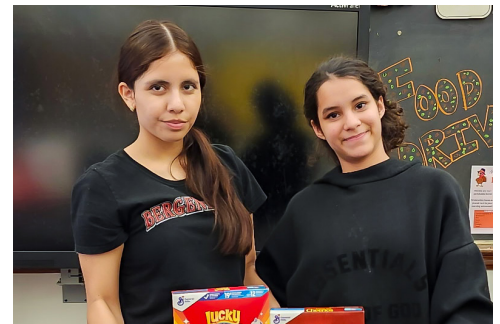
Students carrying donated food.