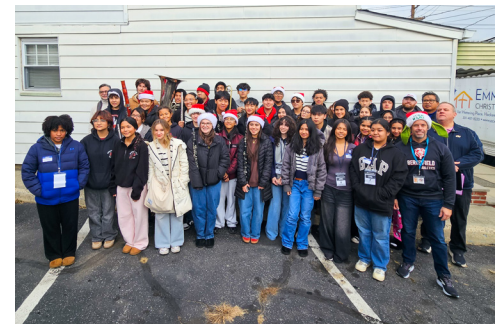
Students and staff at the church.

In December, students and staff members from Bergenfield High School volunteered at Emmanuel Christian Church in Hackensack, where they helped serve a delicious, warm meal to the homeless. In addition, over sixteen music students played traditional holiday music while dinner was served.