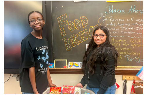
Students carrying donated food.