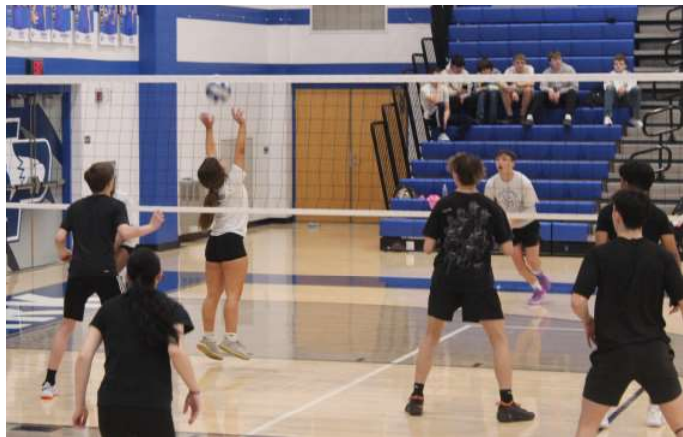
Volleyball teams in action