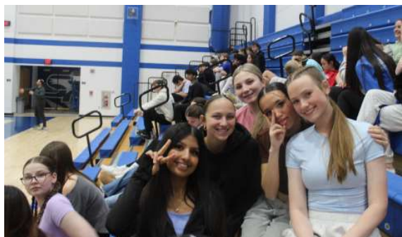
Students cheer on their favorite teams