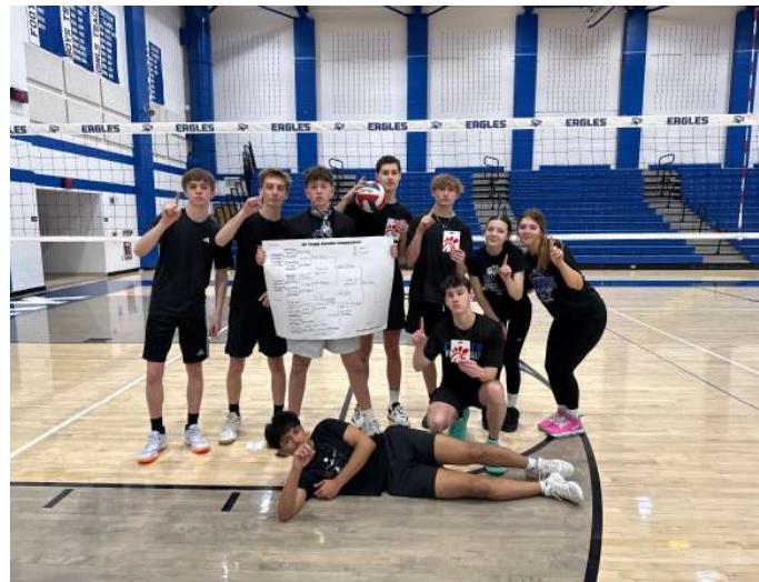
Block Party takes home the win