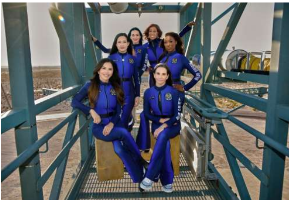
The women before the flight to space.

It's great to be able to do this in order to advance our knowledge of space and science every once and a while, however a fun trip to space just to go look out a window doesn't seem very inspiring or advanced.