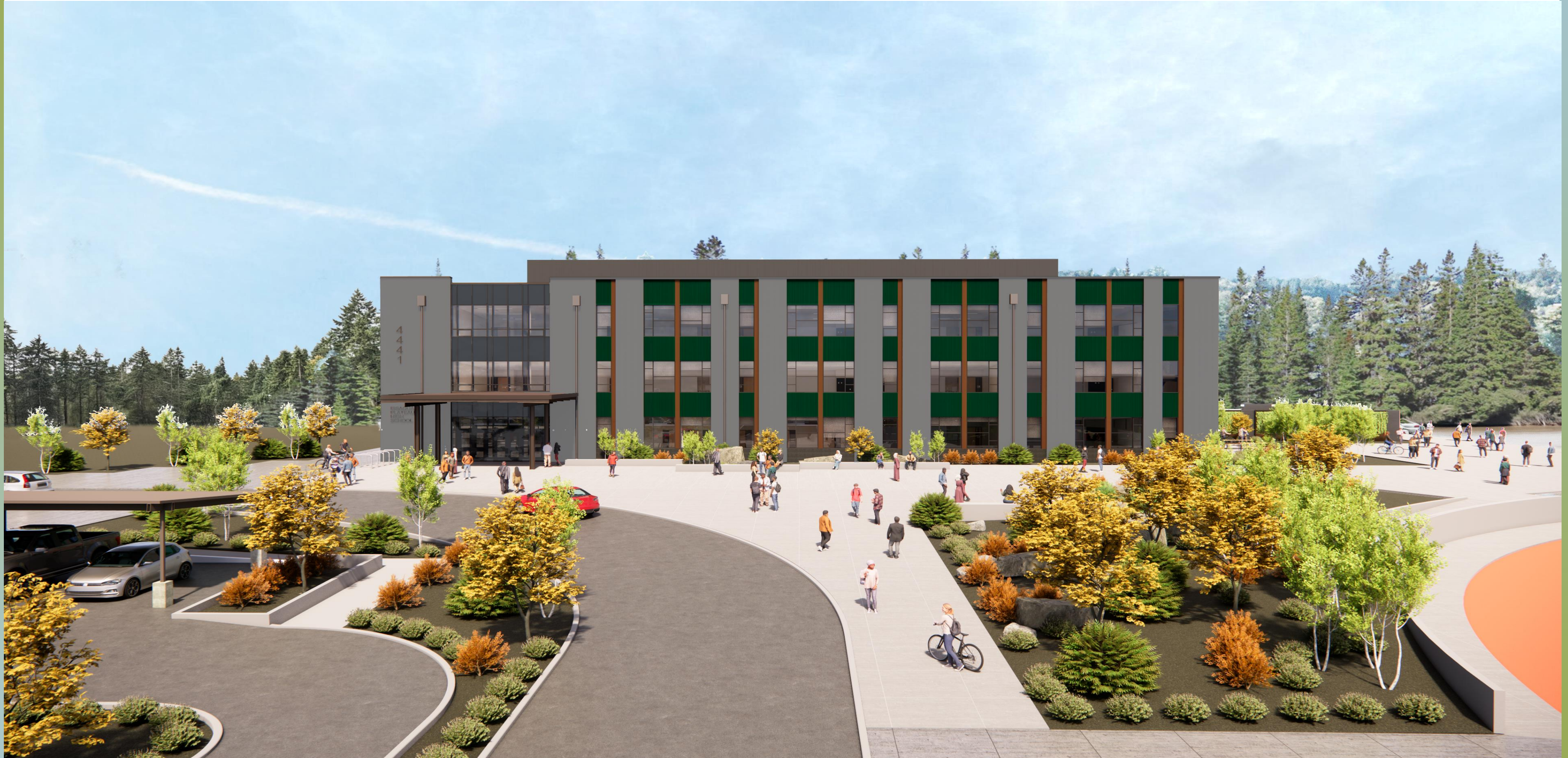
Front Entry – New High School