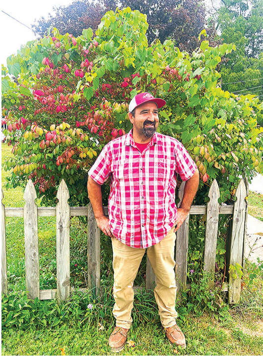
By Addisyn Mendez-Martin

Students were tasked with photographing three different people and capturing each subject's essence within the frame. They also considered composition while editing their images in Adobe Photoshop. Here are some examples of the students' work.