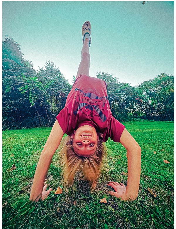
By Nevaeh Bingel