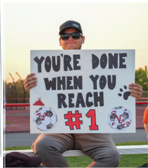
Cougar fan at the under the lights soccer game!