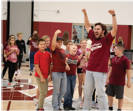
Students and staff are excited about the pep rally leading up to Homecoming weekend in October.