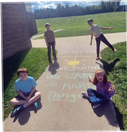
Elementary students starting the year off on a positive note.