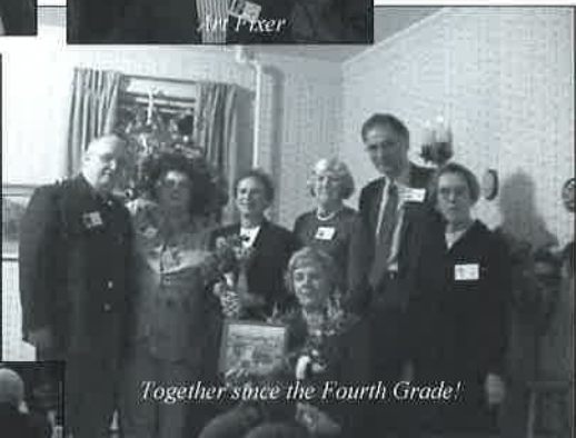
Together since the Fourth Grade!