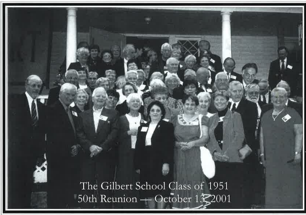
The Gilbert School Class of 1951 50th Reunion — October 13, 2001

The Class of 1951 gathered on the steps of Ye Olde Newgate Coon Club in Norfolk, Connecticut, to celebrate 50 years since their graduation! More than 50 classmates, along with spouses and guests, attended this special evening. Many met up earlier in the day at the School's Homecoming festivities and then concluded their weekend get-together with a light breakfast held on Sunday morning at the School. The Reunion Committee is to be commended for doing such a fantastic job in finding and bringing together so many of their classmates for this memorable event.