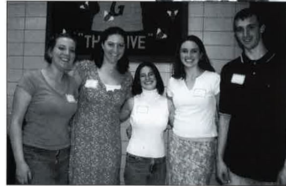
▶ Student volunteers from the Leo Club were a big hit at the supper—our golden grads enjoyed hearing about what's new at Gilbert!