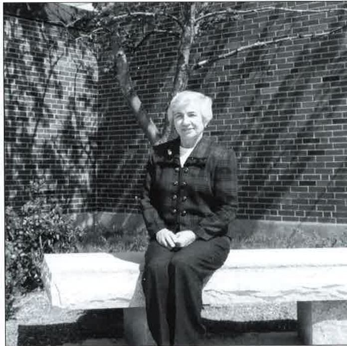
"The Gilbert School community is deeply grateful for your unwavering support as you have worked with students, parents, faculty, staff and alumni. Your cheery and always pleasant demeanor, coupled with your professional presence and work ethic, have been the hallmarks of your tenure. We wish you the best as you enjoy the rewards of retirement." —Celebration of Education 2002—