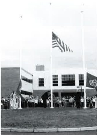
At an all-school assembly on May 17 th , the United States flag, flanked by the Connecticut state flag and the new Gilbert School flag, were raised at the East Entrance for the first time. See next page for details on other Founder's Day festivities.