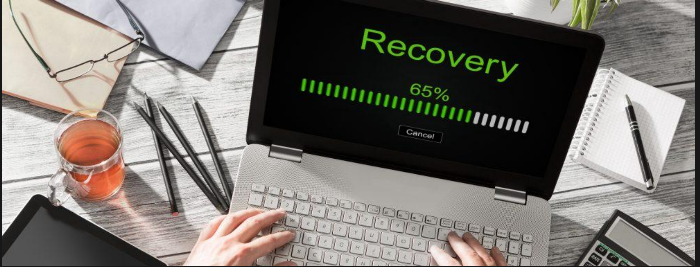
REVIEW RECOVERY LAPTOP