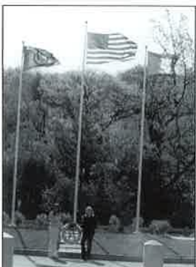
FOUNDER'S DAY 2003

Recently a member of the Class of 1942 contacted the Alumni Office hoping to find a recipe for that scrumptious olive relish she remembers from her days as a student at Gilbert's original location, now NCCC. If you remember it, too, and know of a way to get the recipe, please contact the Alumni Office.