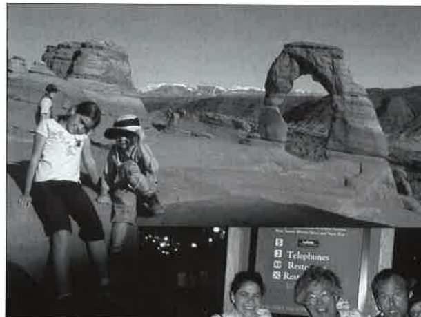
◀ Utah's famous Delicate Arch