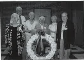
Members of the Class of 1939 at the Blue & Gold Reunion in May.