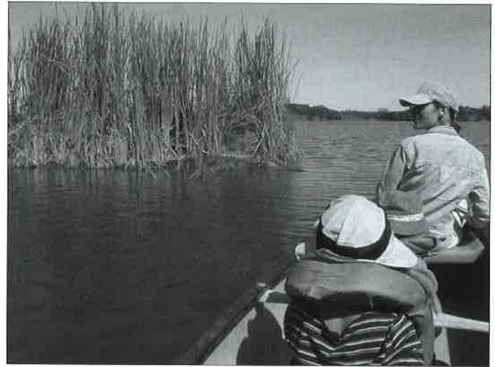
▲ Peaceful canoe ride

People often ask me whether the trip was all I had