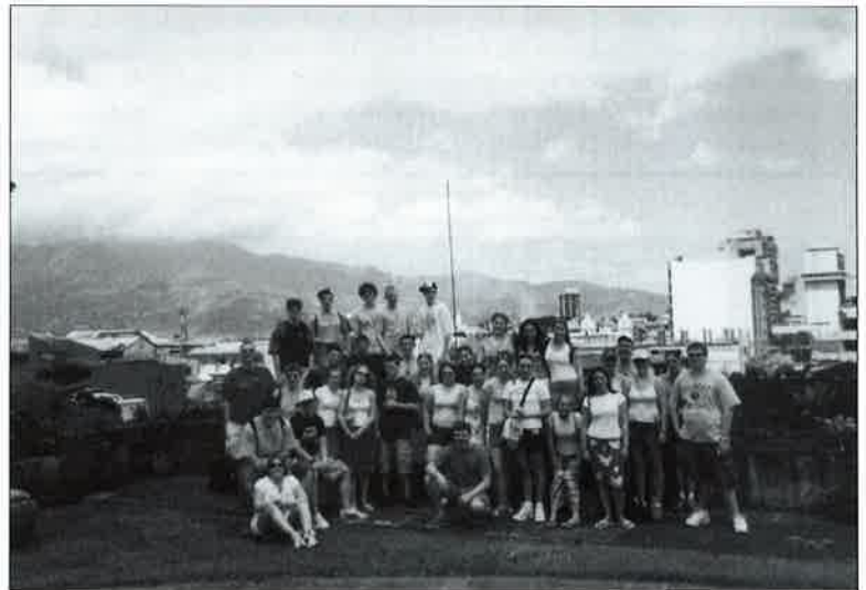
Gilbert students at National Museum of History in San José, Costa Rica.