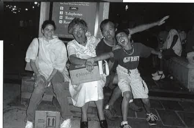
▶ "Working" the crowd in Chicago.