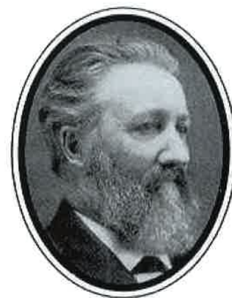
WILLIAM LEWIS GILBERT

Born December 30, 1806 Died June 29, 1890