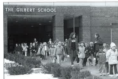
Special thanks to Laidlaw Bus Company and their drivers, whose buses brought children to Gilbert from the Hinsdale and Batcheller Schools for a special holiday concert.

The school band and choir provided a special treat for the town's schoolchildren on December 22 nd and 23 rd before the holiday break. On Wednesday the 22 nd , the band and choir boarded a bus and brought a holiday concert to Hartland Elementary School, Pearson Middle School and St. Anthony's. Then the next day, through the generosity of the Laidlaw Bus Company and their drivers, buses brought children to Gilbert from the Hinsdale and Batcheller Schools for a special holiday concert. The smiles on all those little faces as they sang along to their favorite holiday tunes was worth more than a thousand words! ❖