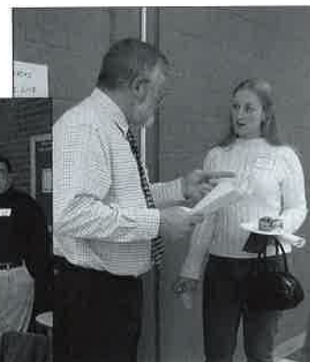
Recent graduates visited The Gilbert School for Young Alumni & Career Day