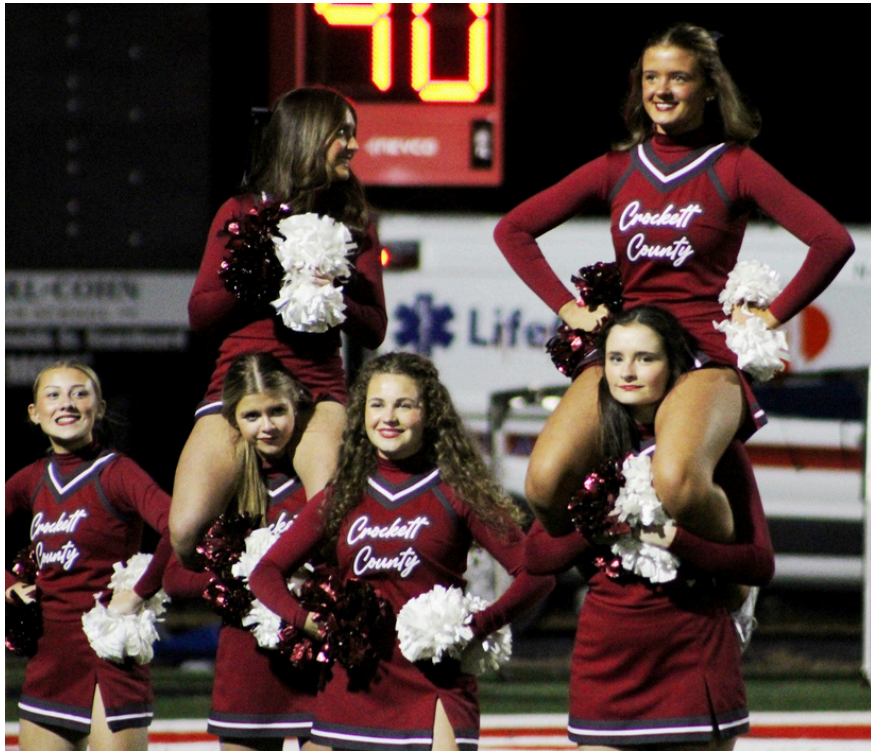
Above: During the football playoffs at Pearl-Cohn.