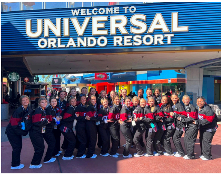
Above: The squad at the entrance to Universal Resort in Orlando.