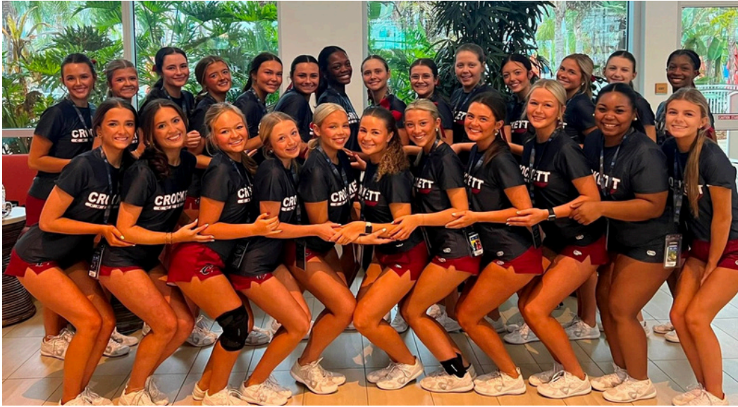
Above: Ready for competition to begin.

When people generally think about cheerleading, they often don't realize the difference between the stereotyped "sideline window dressing" and the competition squads.