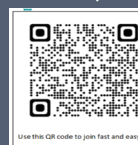
Use this QR code to join fast and easy!

If you are not a current PTA member, please consider joining PTA by clicking on this QR Code