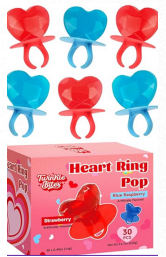
(One ring pop)