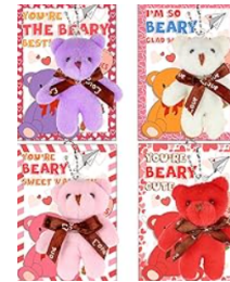
(One Teddy Bear)