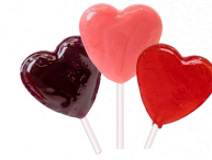
(One heart pop)