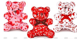
(One Teddy Bear)