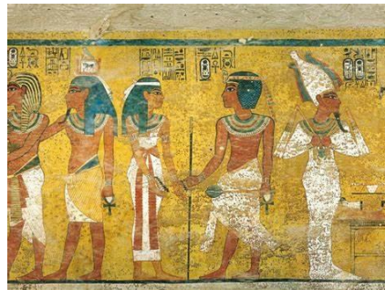
Wall painting from the Tomb of Tutankhamun