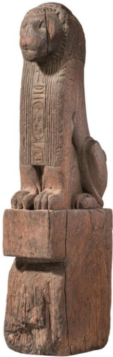
Wooden figure of a sitting lion inscribed in Egyptian hieroglyphs with the name of the Kushite king Aspelta (c.600–580 BCE).