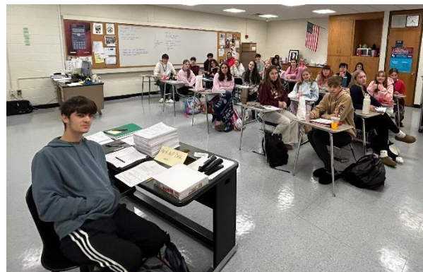
An early morning AP Calculus tutoring session

Walk through our halls and you will feel the warmth of our values in action. Students support one another, take pride in their work, and approach their education with integrity and heart. On the field, in the robotics lab, on the stage through theatre arts, Civics projects, and in countless other activities, they find their place, forge lasting friendships, and discover what it means to be part of something larger than themselves.