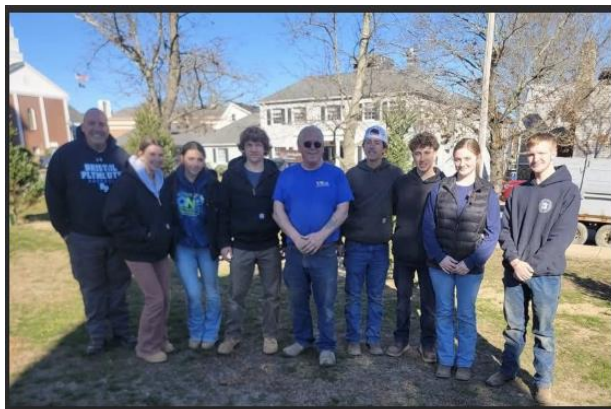
B-P Electrical Students

Electrical students completed extensive community-based work, including electrical upgrades for the Dighton Library, installation of an EV charging station for the Taunton Housing Authority, electrical work for Old Colony Habitat for Humanity, and municipal upgrades for the Middleboro Town Hall.