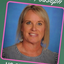
HS CTE Counselor