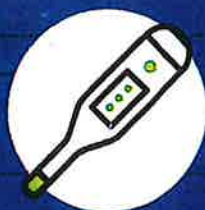
Fever or chills