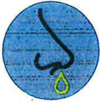
Runny or stuffy nose