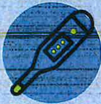
Fever or chills