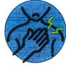
Mild to moderate chest discomfort