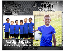
Memory Mate = Team & Individual!