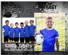
Memory Mate = Team & Individual!