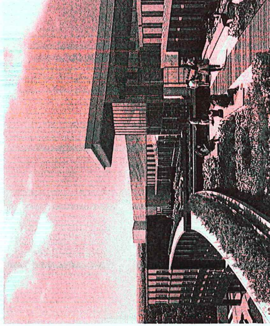
Waltham High School

The SMMA is a charitable organization established by the directors of Symmes Maini & McKee Associates, Inc. to support the communities that SMMA serves and the charitable activities of its employees. The Fund provides assistance to organizations and individuals through scholarships and grants.