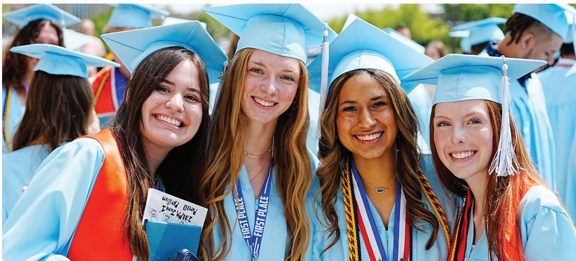
Our graduates shine bright as they step into the next chapter.

Restricted and designated gifts are made in support of special initiatives or to meet a need of the school that is outside of the annual budget. Included in this list are contributions to academic and co-curricular programs, the fine arts, athletics, student services, and student ministry programs.