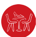
Fashion and Interior Design