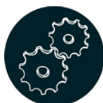
Manufacturing and Product Development