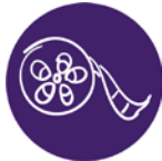
Arts, Media, and Entertainment