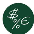
Business and Finance