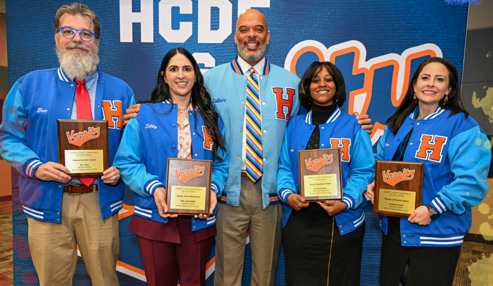
HCDE CELEBRATES 'VARSITY' LEADERSHIP AT SCHOOL BOARD RECOGNITION RECEPTION P.3