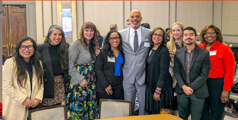
#TEAMHCDE SUPPORTS SPRING ISD AT STATE OF THE DISTRICT EVENT P.8