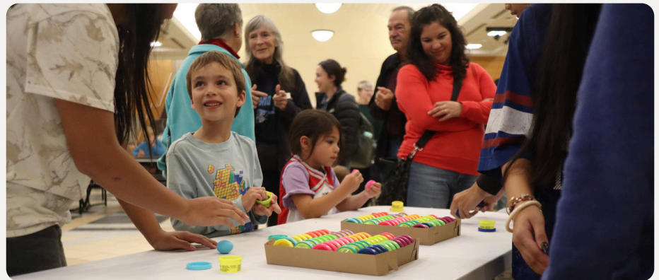
School Nutrition Spotlight