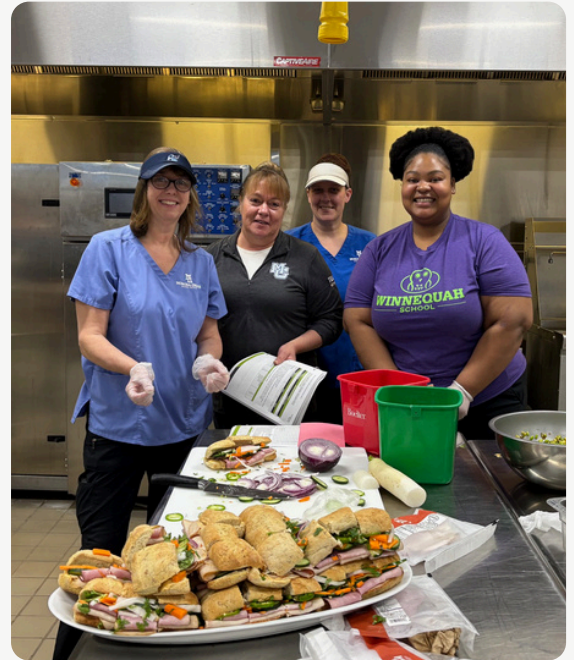
MG Kitchen Managers Prepare the Banh Mi Sub

Winnequah kitchen staff gladly pose during our first themed menu day - Go Orange! during the second week of school.