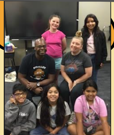
Admin and the Club