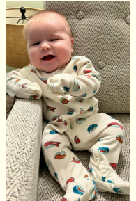
Thomas Woods Mini Mammoths

These Mini Mammoths joined our school during the 2023-2024 school year.