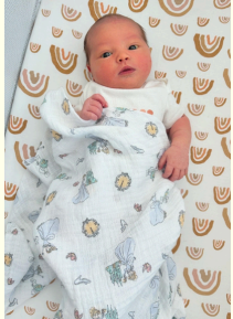
Lyvvi Kirby Mini Mammoths