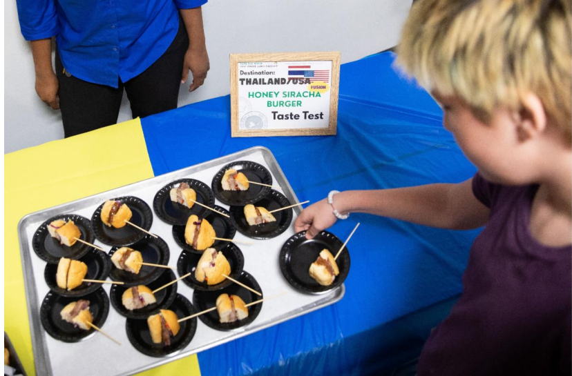
A student at Morgan Fitzgerald Middle School prepares to sample the honey siracha burger during Food & Nutrition's visit to the school.