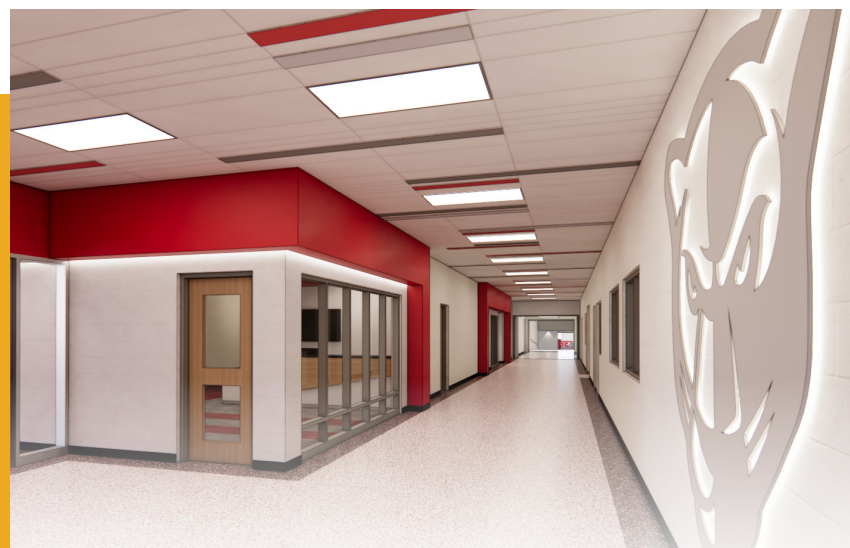
Preliminary Rendering of Farnsworth Middle School Interior Main Entry