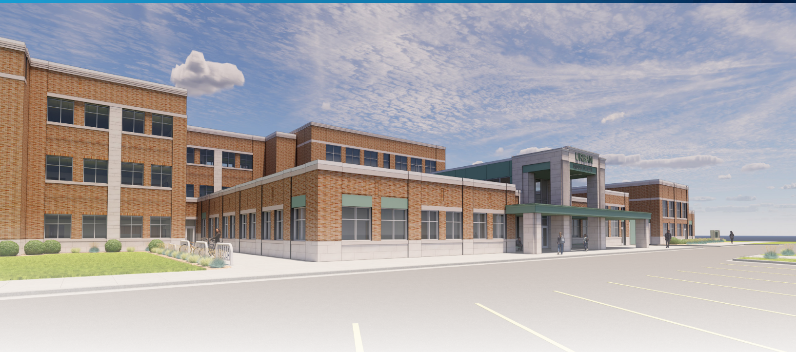
Preliminary Rendering of Urban on the New West Entry