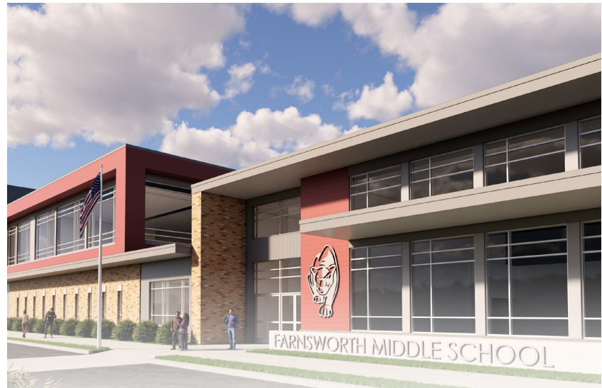
Preliminary Rendering of Farnsworth Middle School Exterior Main Entry