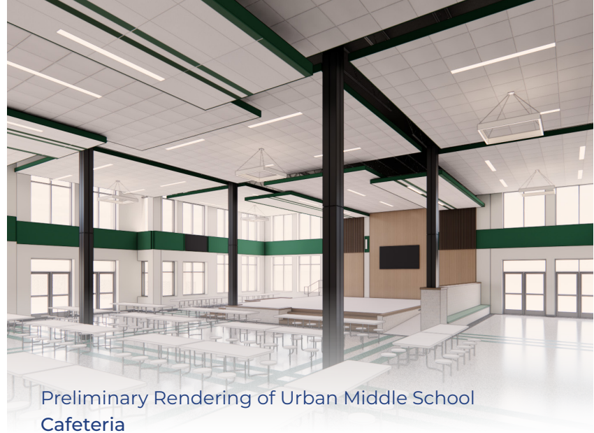
Preliminary Rendering of Urban Middle School Cafeteria

The bidding schedule has been adjusted so that Urban Middle School is bid first, allowing the market to respond before Farnsworth Middle School follows about one month later. While phasing discussions remain ongoing, the anticipated timeline calls for construction at Farnsworth to begin in June 2026. At Urban, some site demolition may begin in the spring, though the majority of construction activity is also expected to start in June 2026. Additional information regarding phasing and scheduling will be shared with families in the months ahead.