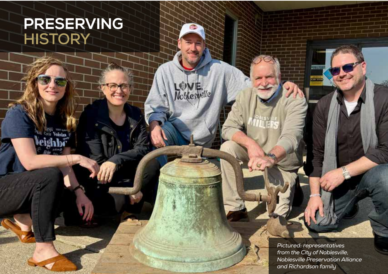
Pictured: representatives from the City of Noblesville, Noblesville Preservation Alliance and Richardson family

Several years ago, Noblesville Schools received a historic school bell from the Richardson family, who has called Noblesville home for over five generations. The bell, which is believed to date back to the 1850s or earlier, originally hung at Second Ward School, the site of today's Seminary Park and home to Noblesville's first high school. Through a partnership between Noblesville Schools, the City of Noblesville, the Noblesville Preservation Alliance, and the Richardson family, plans are underway to give the bell a permanent home in Seminary Park for the entire community to enjoy.