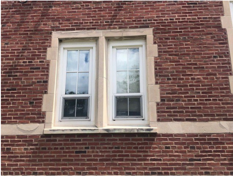
Masonry header and banding repairs