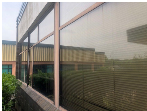
Typical aluminum window frame conditions