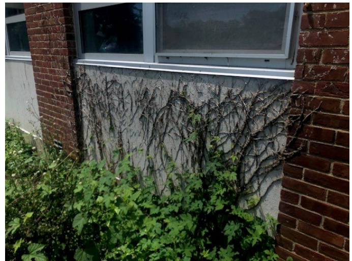
Typical lintel, caulking and EIFS repair conditions