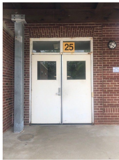
Typical exterior door conditions