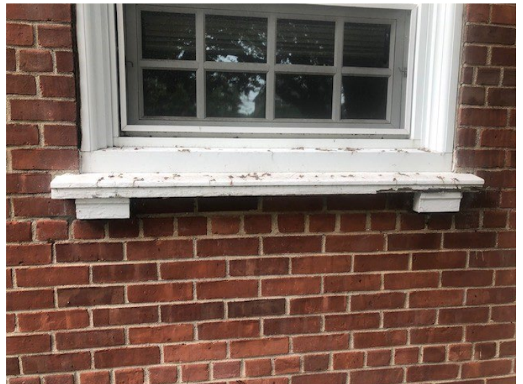
Typical sill and main entry header scroll repair conditions