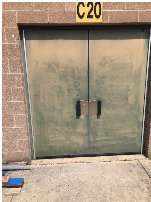
Exterior frames and doors to be primed and painted