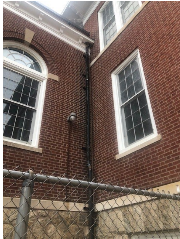
Typical exterior louver, doors, and rain leader piping conditions