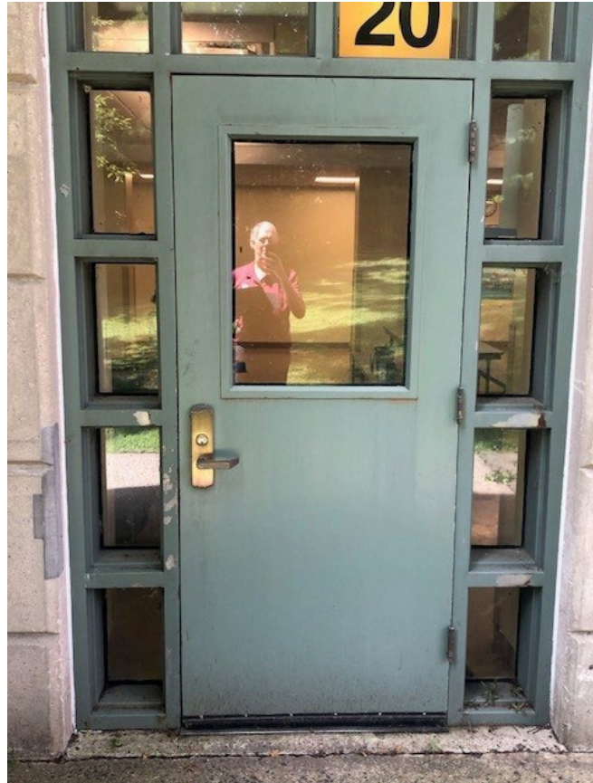
Door frame conditions requiring repair and repainting