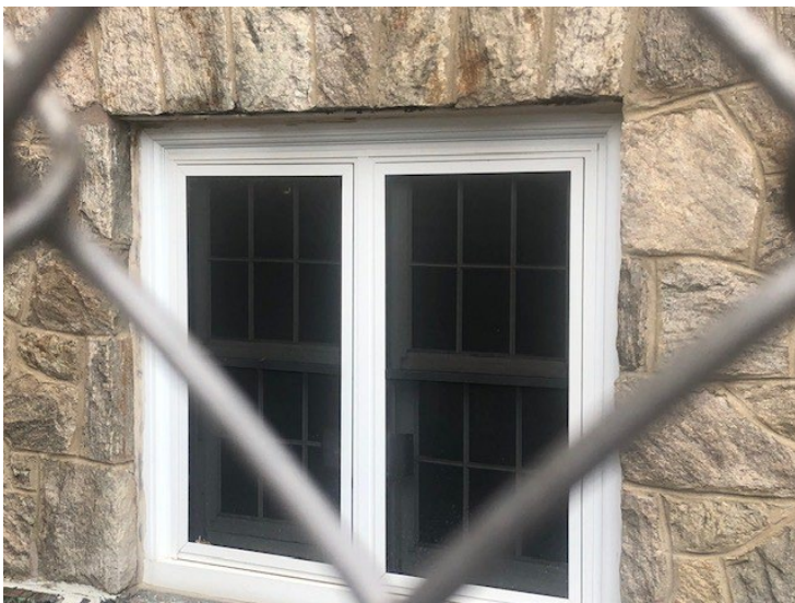
Typical lintel conditions