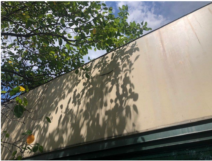
Fascia panel repair in Courtyard