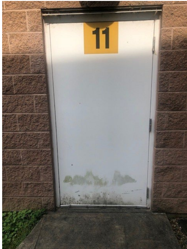
Exterior access door and doors locations to be addressed