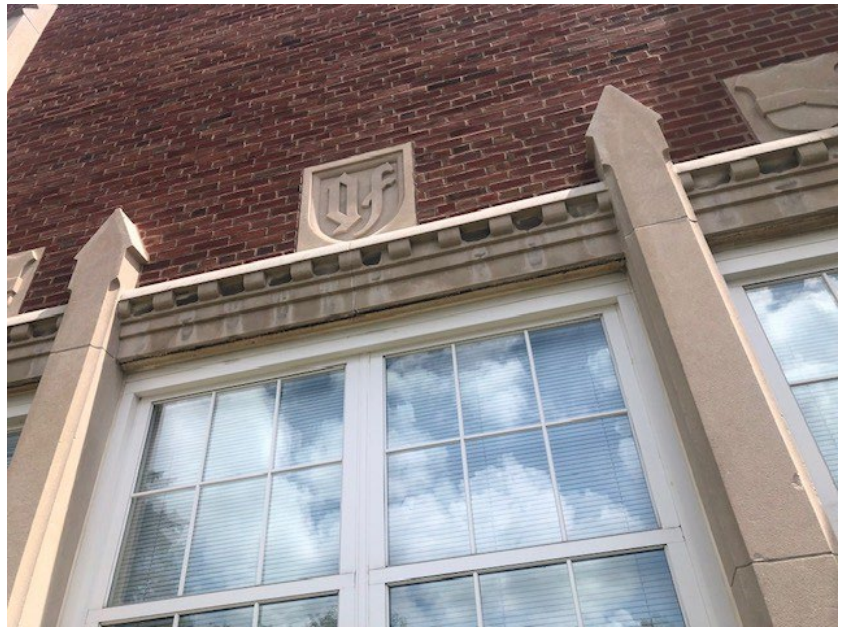
Typical lintel conditions