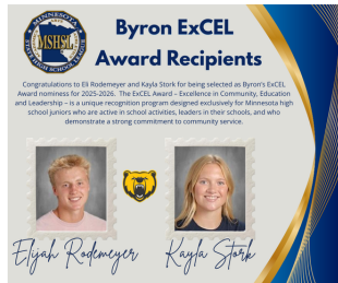
Byron ExCEL Award Recipients