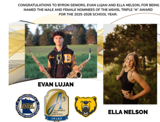
Byron Triple A Award Nominees