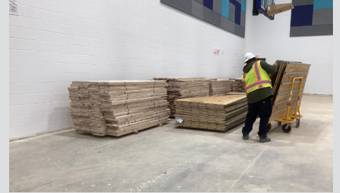
The wood strips must sit in a controlled environment for 7 days before it can be installed.

The "wood strip flooring" for Eastman Leadership Academy's new basketball court is being installed, and a lot of preparation had to happen to get to this point! Underneath the carefully placed wood strips is a layer of concrete, vapor retarder (to protect from moisture), channel sleepers (timber supports), and plywood subfloor on top. The team installs steel channels and cushioning to hold the strips in place. Once the strips are all laid down, they'll be polished and all of the lines and logos will be painted!