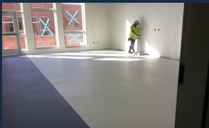
First floor tile install and rolling (Area B)