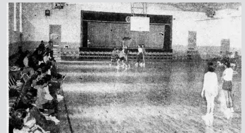
The Rocky Mount Sunday Telegram announces new "gymnasium" at the Eastman High School (January, 1952)