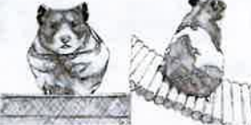
Hemagiere is my monster her name is a fusion of monster and hemisphere. Hemagiere has a unique pattern on her back.

Students are introduced to hand-building methods such as pinch, coil, sculpture, and slab building, in addition to exploring the potter's wheel. A variety of decorative, glazing, and firing techniques are introduced and incorporated into projects.