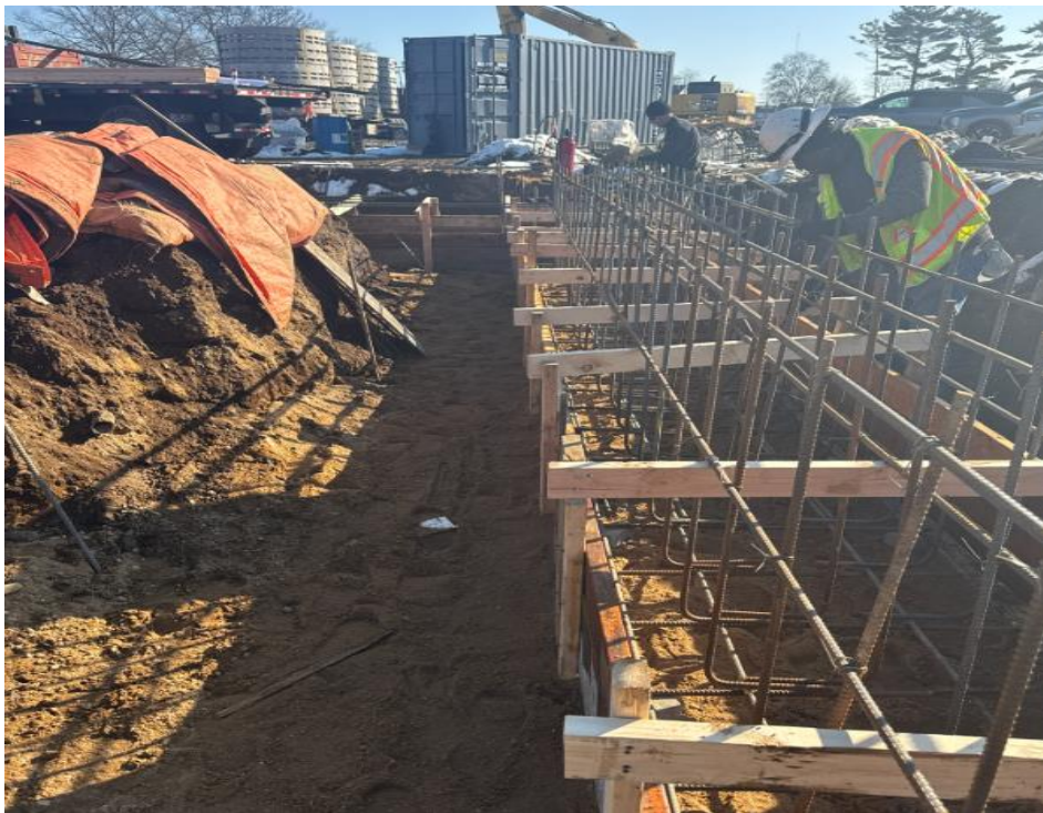
Hempstead ABGS MS – Footings & Foundation wall Rebar