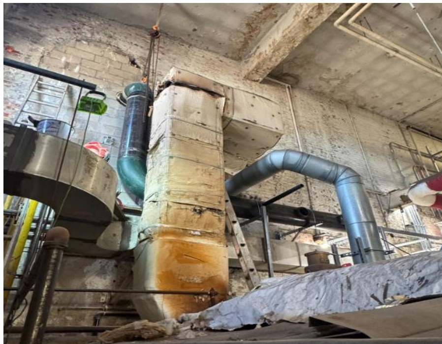
Hempstead ABGS MS – New Gas Feed