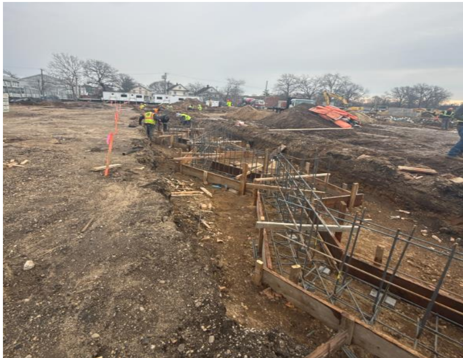
Hempstead ABGS MS – Footings & Foundation wall Rebar