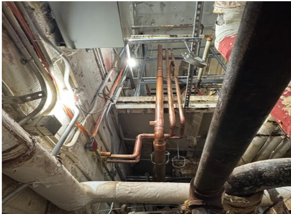
Hempstead ABGS MS – New Domestic Water