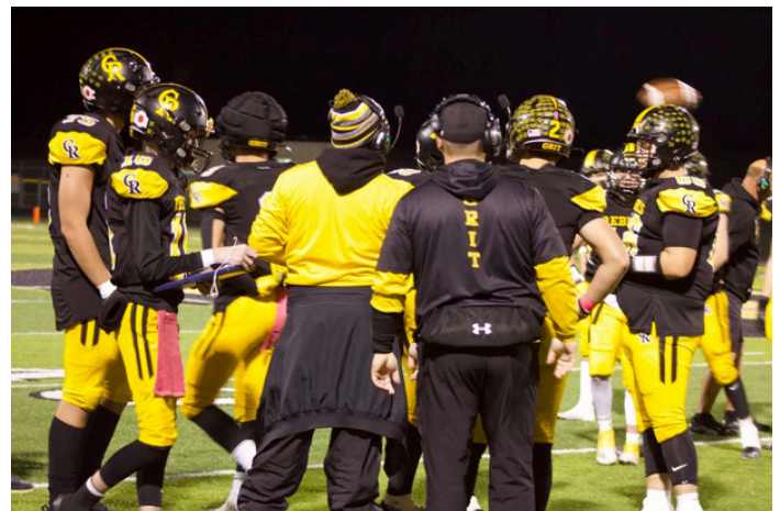
Football players huddle during a recent game.

Overall, the team took a big step forward, winning the MVAC title and earning a spot in the playoffs. The team is looking forward to rebuilding their team during the offseason.