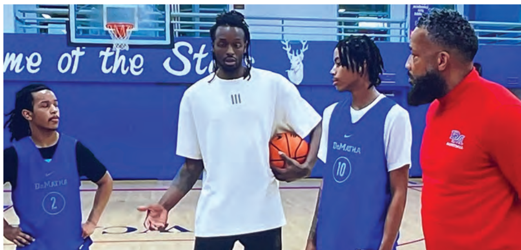
Jerami Grant '12 (second from left) working with members of our basketball program. Jerami's Hour Generation Foundation contributes annually to DeMatha. Jerami was featured this summer on the program "Inspired Lives" for his tremendous work in the community.