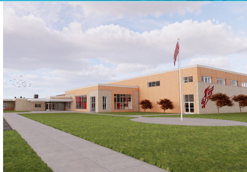
Proposed Franklin Elementary School Addition at Main Entry

Neighborhood Meetings for the Franklin and Oakwood construction projects were successfully held on November 20 and December 2. These sessions, led by Bray Architects, allowed the team to share current progress, answer questions and gather valuable community feedback.