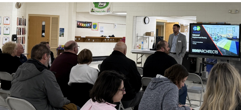
Oakwood Neighborhood Meeting