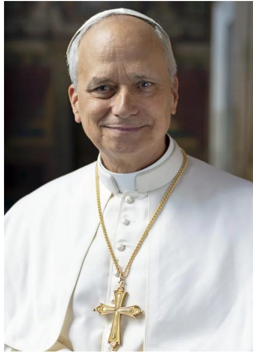
Our Holy Father, Pope Leo XIV