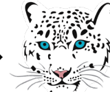
Lake Middle School